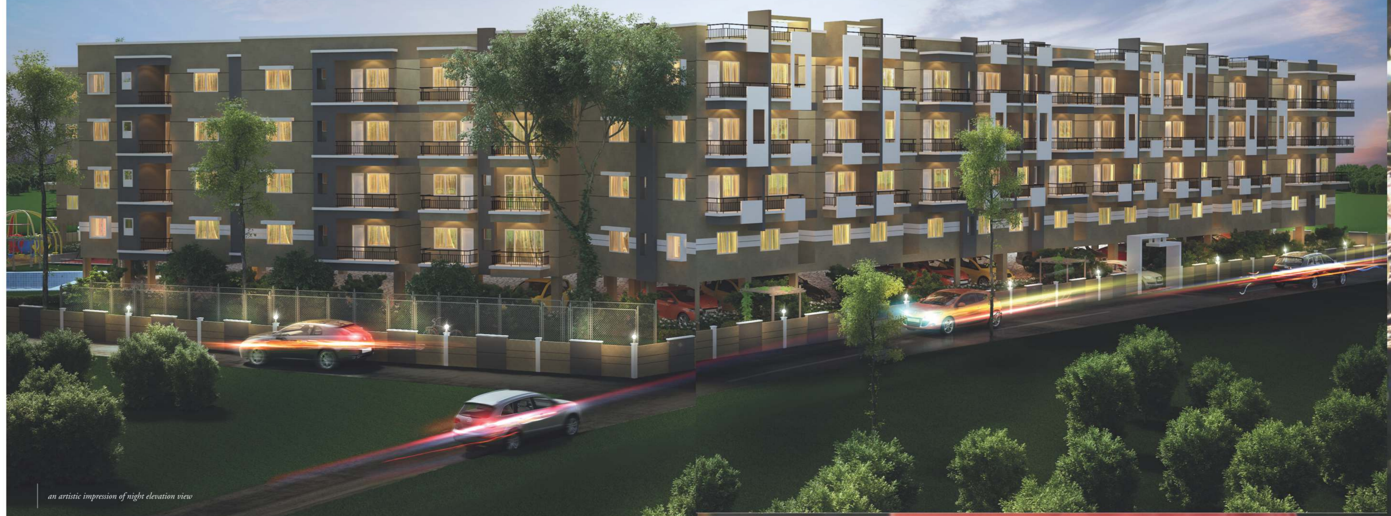
an artistic impression of night elevation view