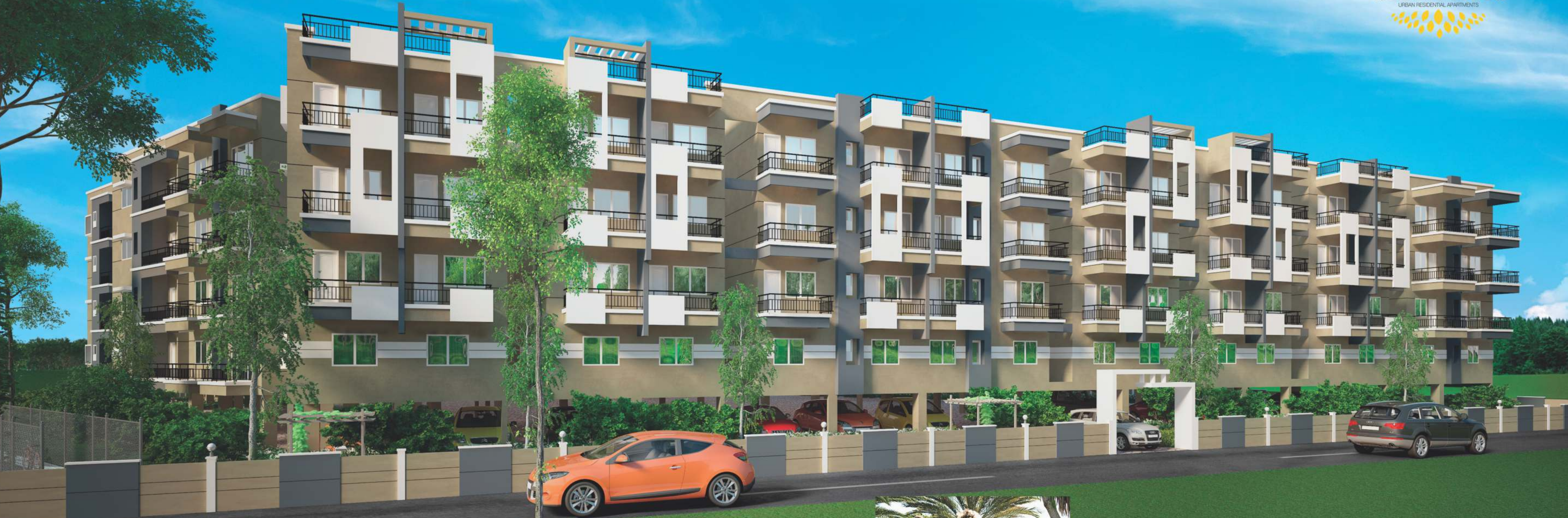
an artistic impression of elevation view