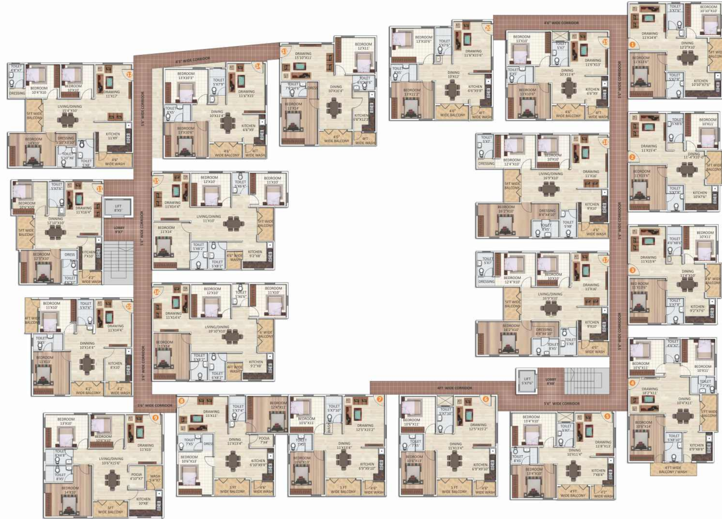
BLOCK A GROUND FLOOR PLAN