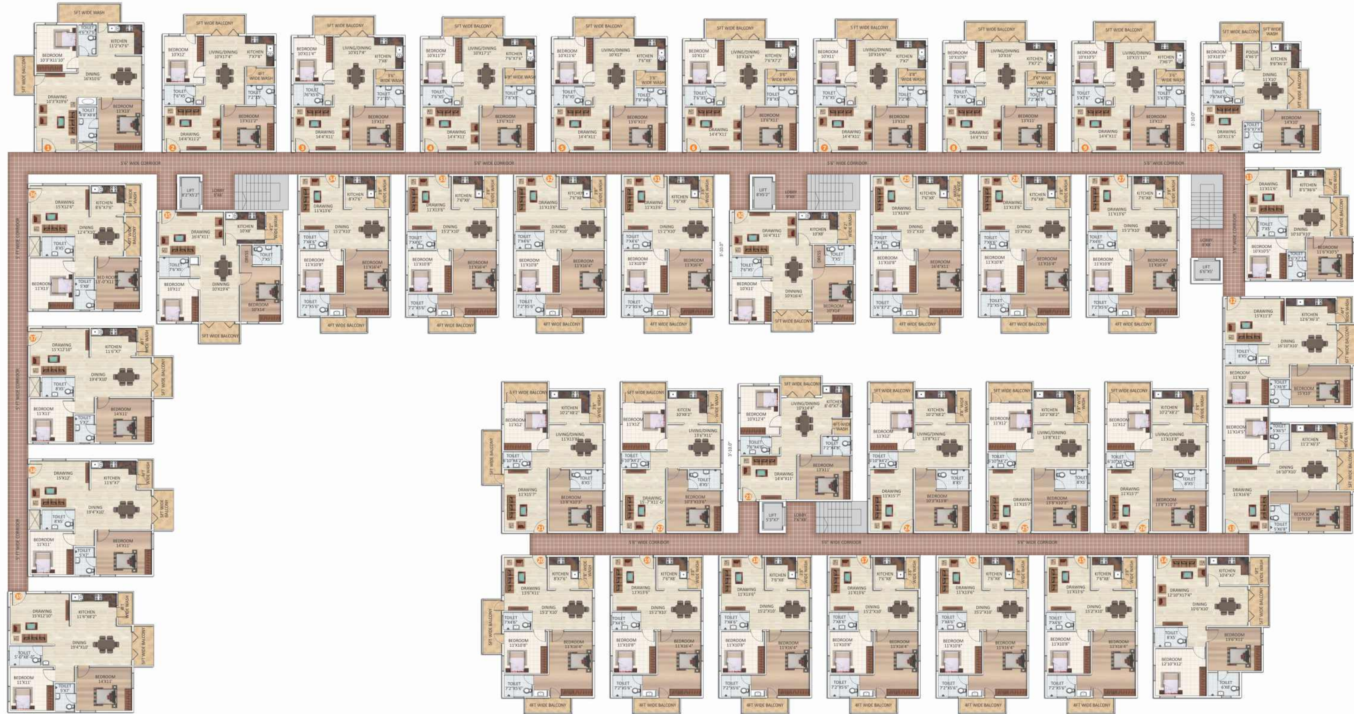
BLOCK B TYPICAL FLOOR PLAN