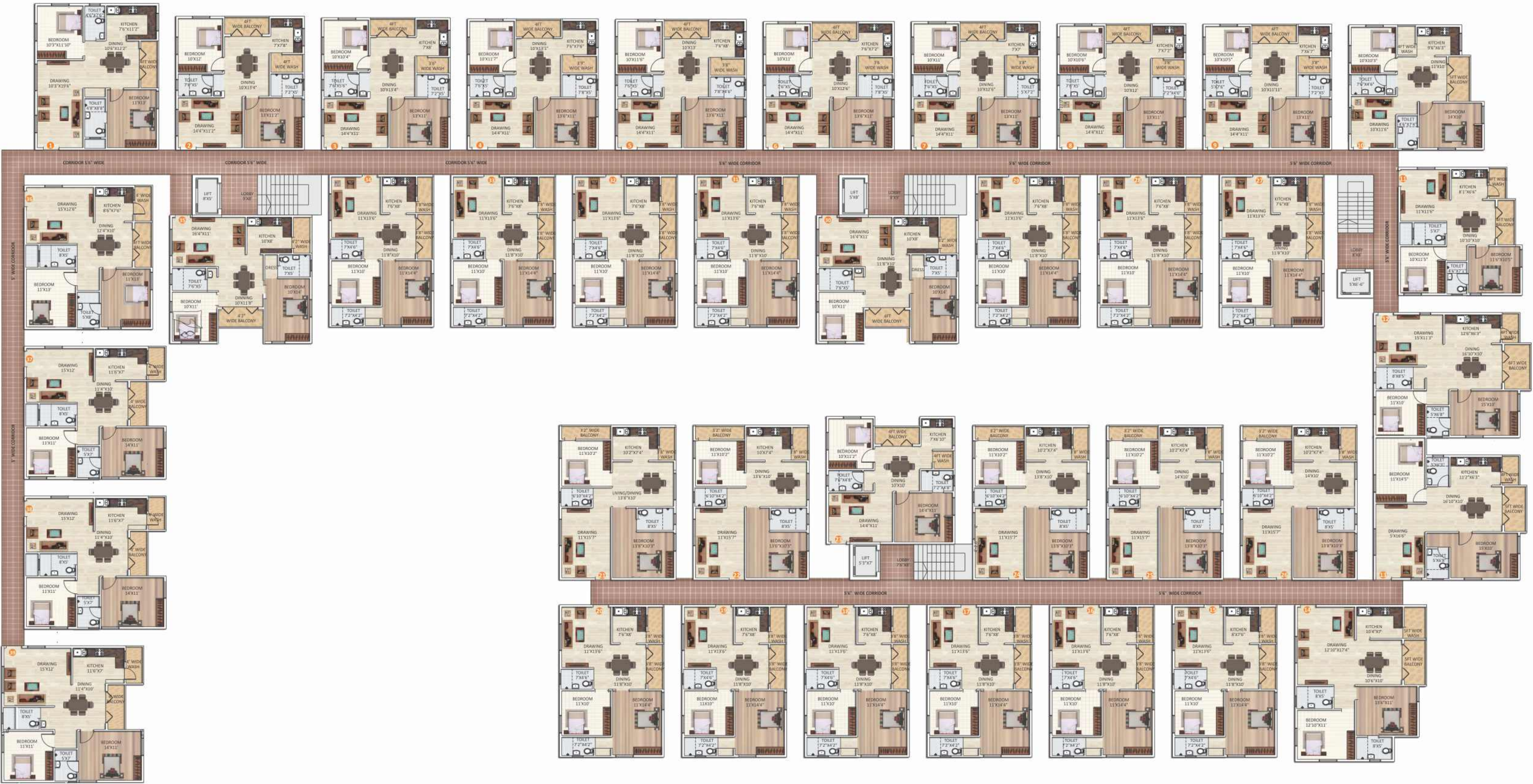
BLOCK B GROUND FLOOR PLAN