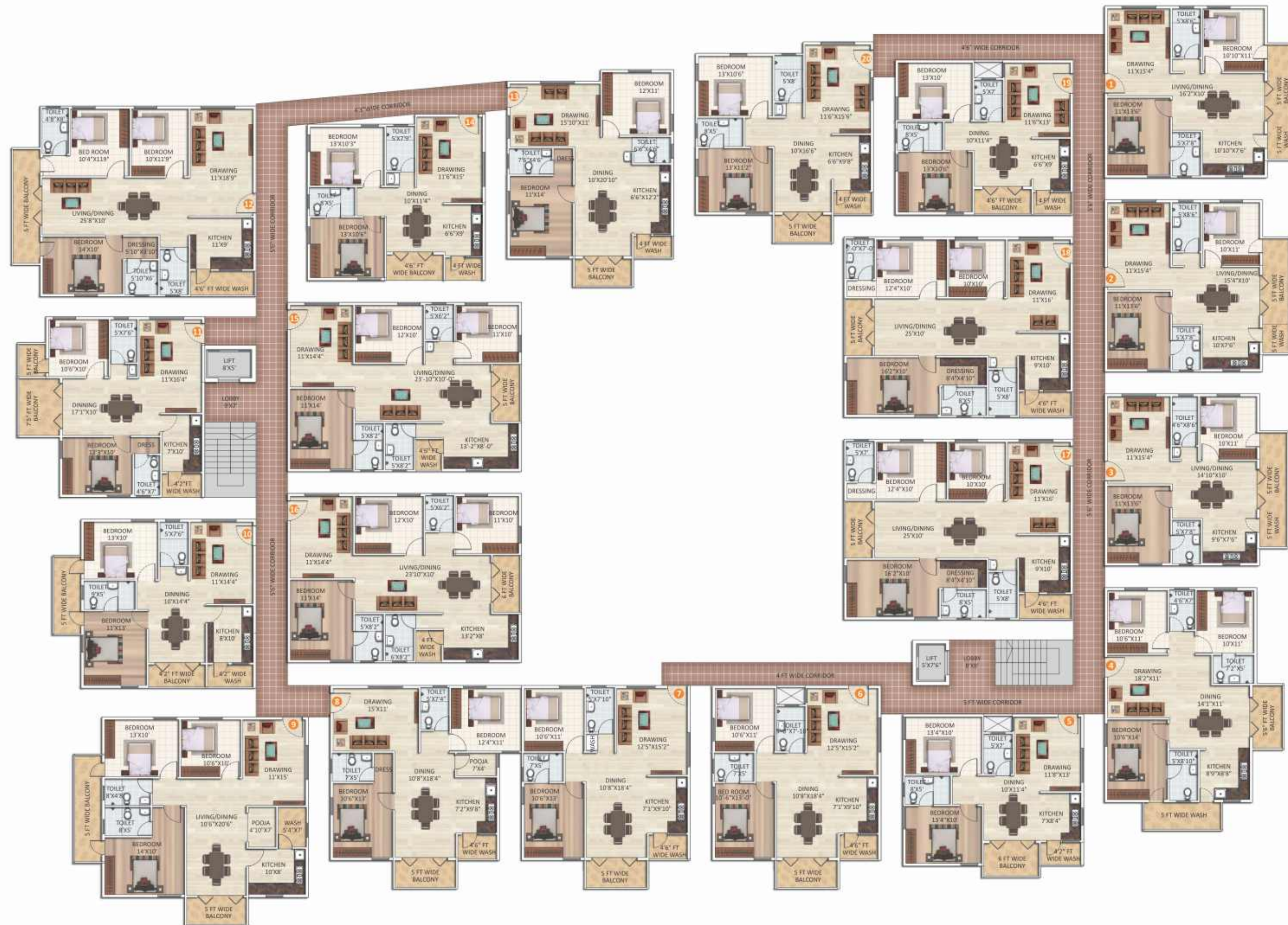
BLOCK A TYPICAL FLOOR PLAN