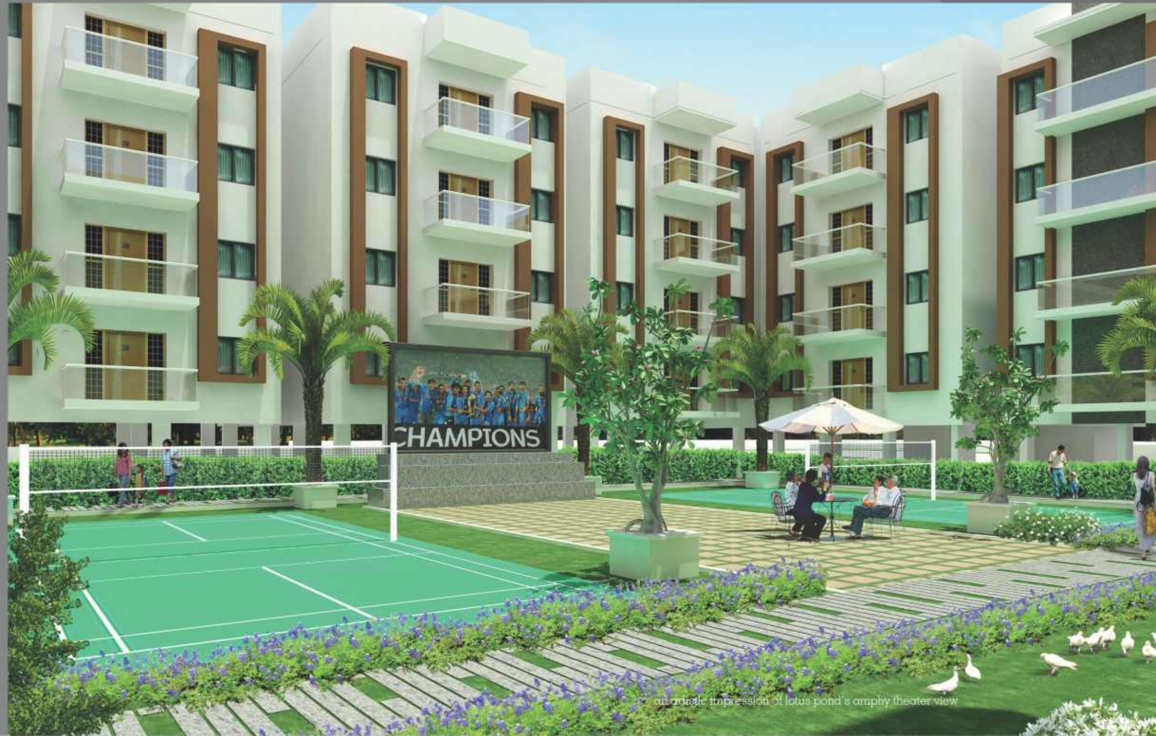
an artistic impression of lotus pond's amphitheater view