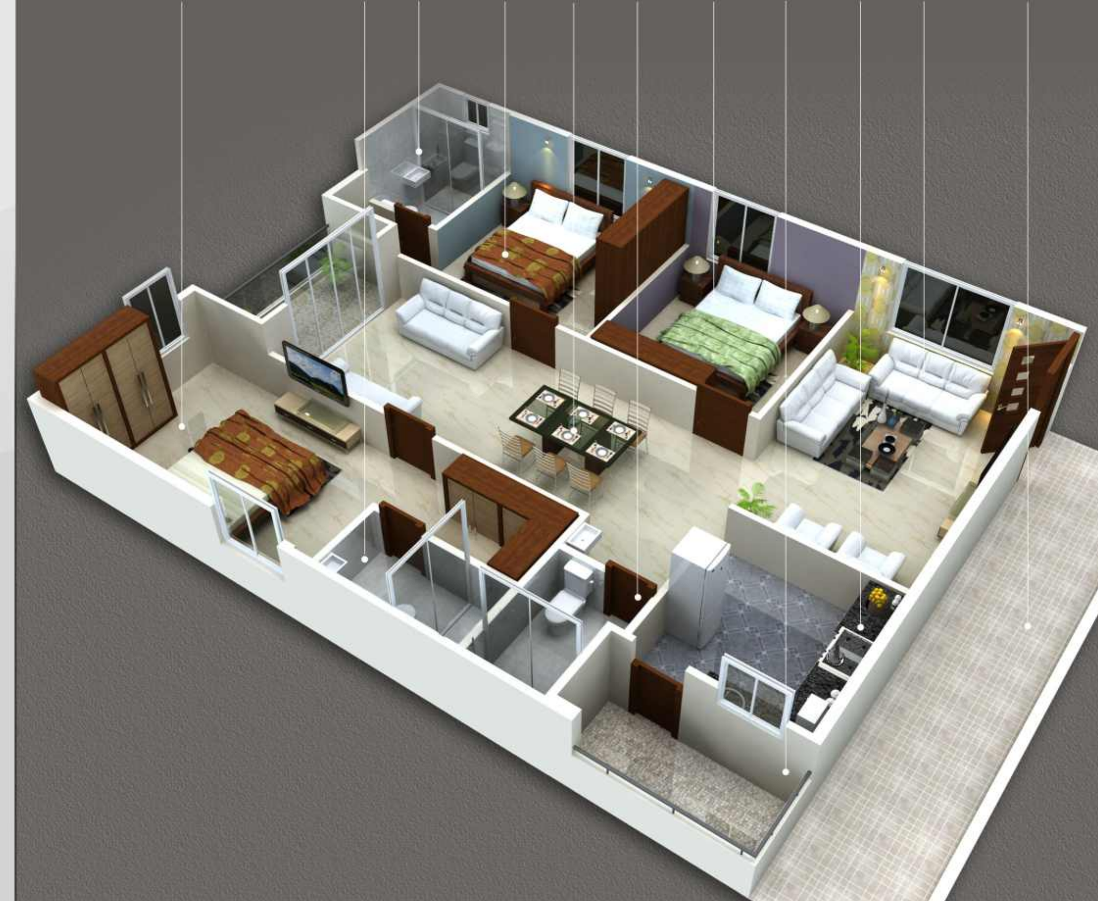
Bedroom Toilet Toilet Bedroom Dining Toilet Bedroom Utility Kitchen Living Corridor