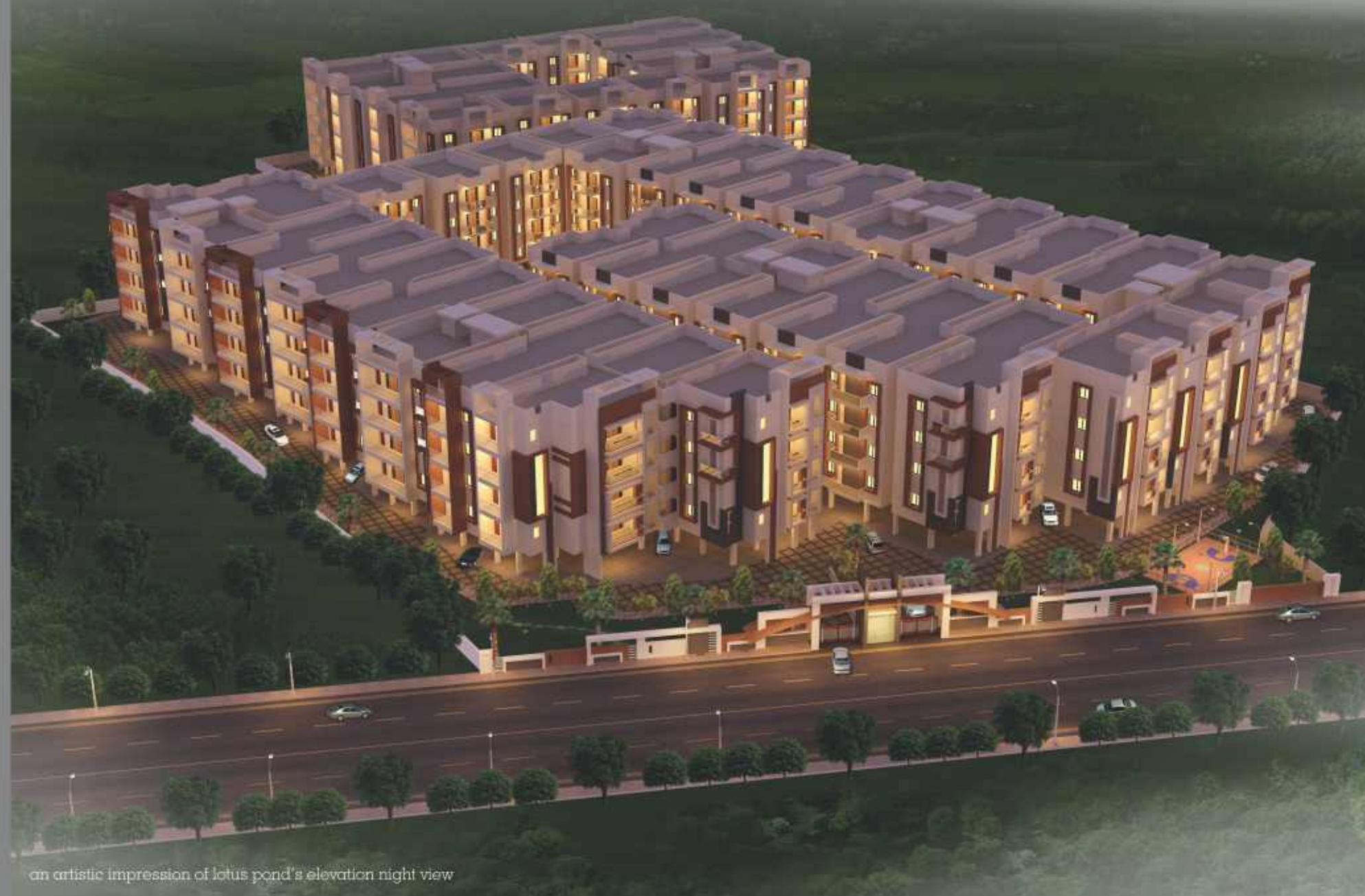
an artistic impression of lotus pond's elevation night view

Securely situated within few minutes from the Varthur Police Station, the site of Lotus Pond is also divinely blessed - as it is very near to two famous temples. From the point of view of driving to work, it is simply a matter of few minutes from Whitefield and is reasonably close to ITPL, Sigma Soft Tech Park and other IT related offices as well. Forum Value Mall is located only minutes from the project - for a relaxed shopping experience. What's more, the Outer Ring Road (ORR), in close proximity, enables connectivity to any part of the city with ease.